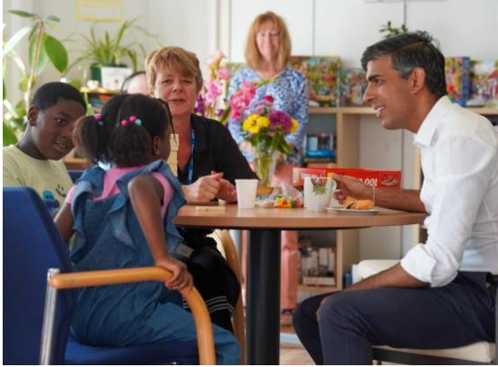
Rishi Sunak visiting UpFront in August 2023